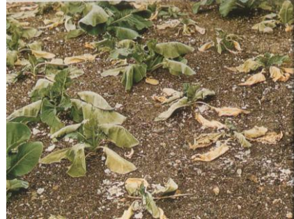
Brassicas devastated by cabbage root fly larvae

Pests may attack crops at a number of growth stages from ungerminated seed and young roots through to young tender stems, up to harvest and in some cases during storage of the produce. The consequence of a pest attack will range from a slight reduction in plant vigour to complete plant death, both of which result in reduced yields. Although pest attack may not directly effect yields, produce quality can be greatly reduced for example wireworms in potatoes.