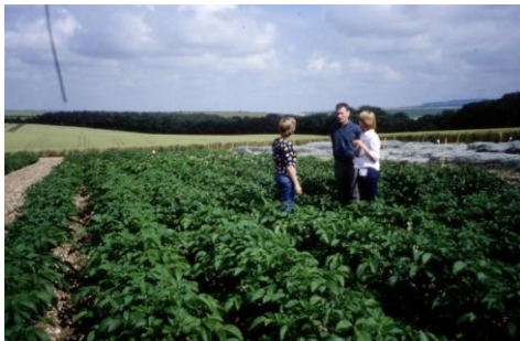
Regular crop inspection is an important part of pest control

Bean seed flies Carrot fly Chafers Colorado beetle Cutworms Free living nematodes Lettuce root aphid Millipedes and centipedes Onion fly Swift moth Symphlids Turnip gall weevil Wingless weevils